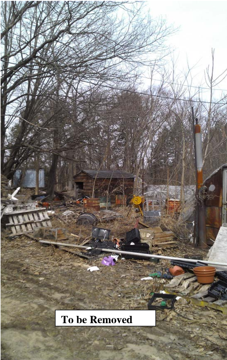
To be Removed