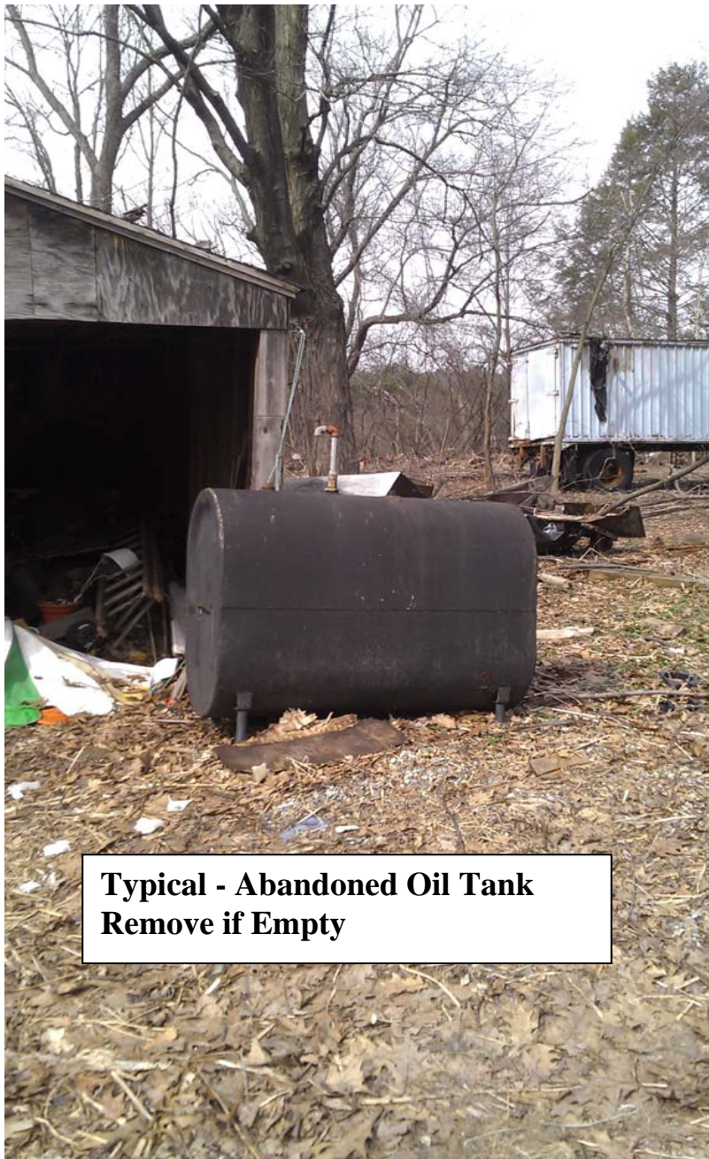
Typical - Abandoned Oil Tank Remove if Empty