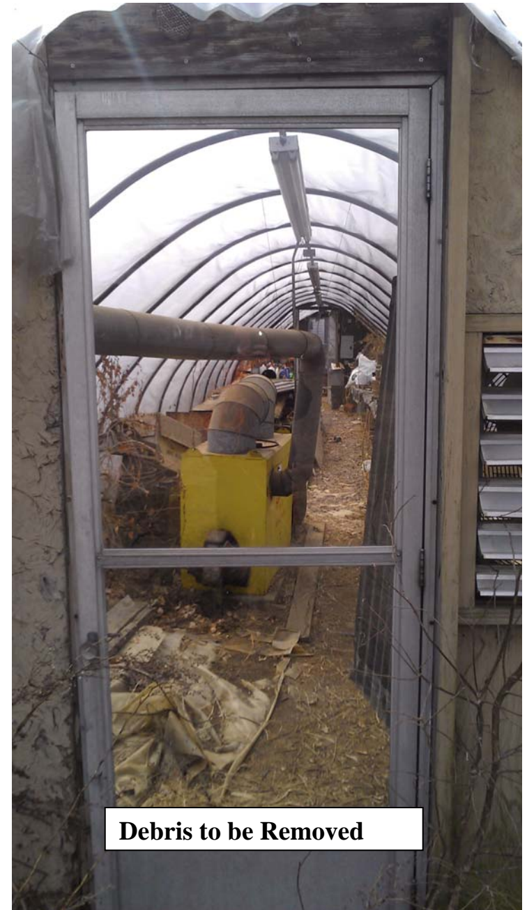
Debris to be Removed