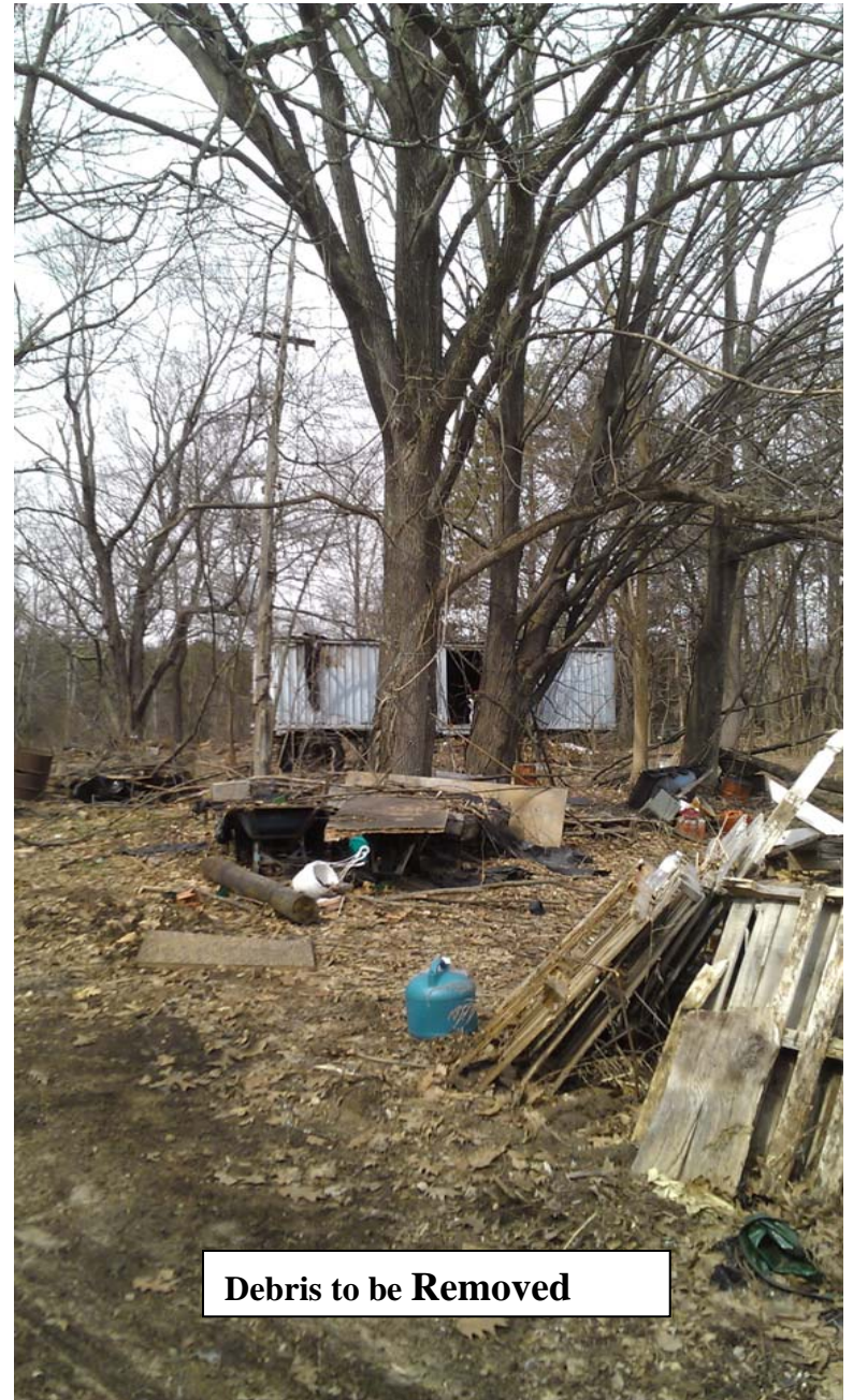
Debris to be Removed