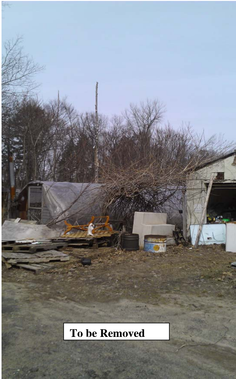
To be Removed