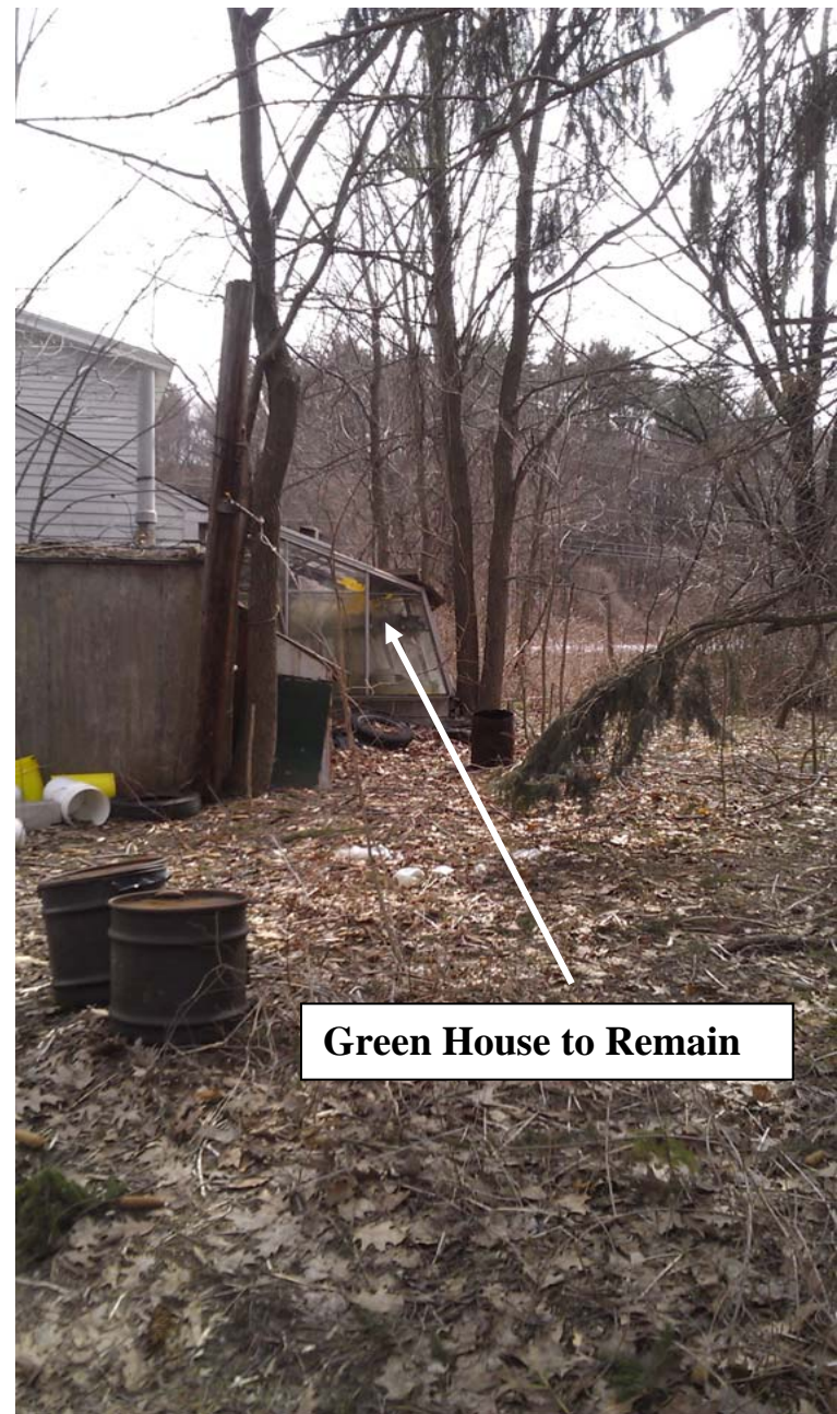
Green House to Remain