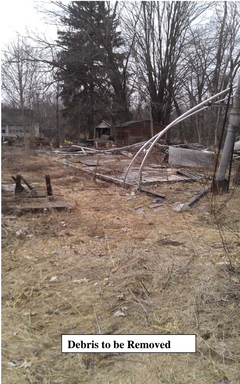
Debris to be Removed