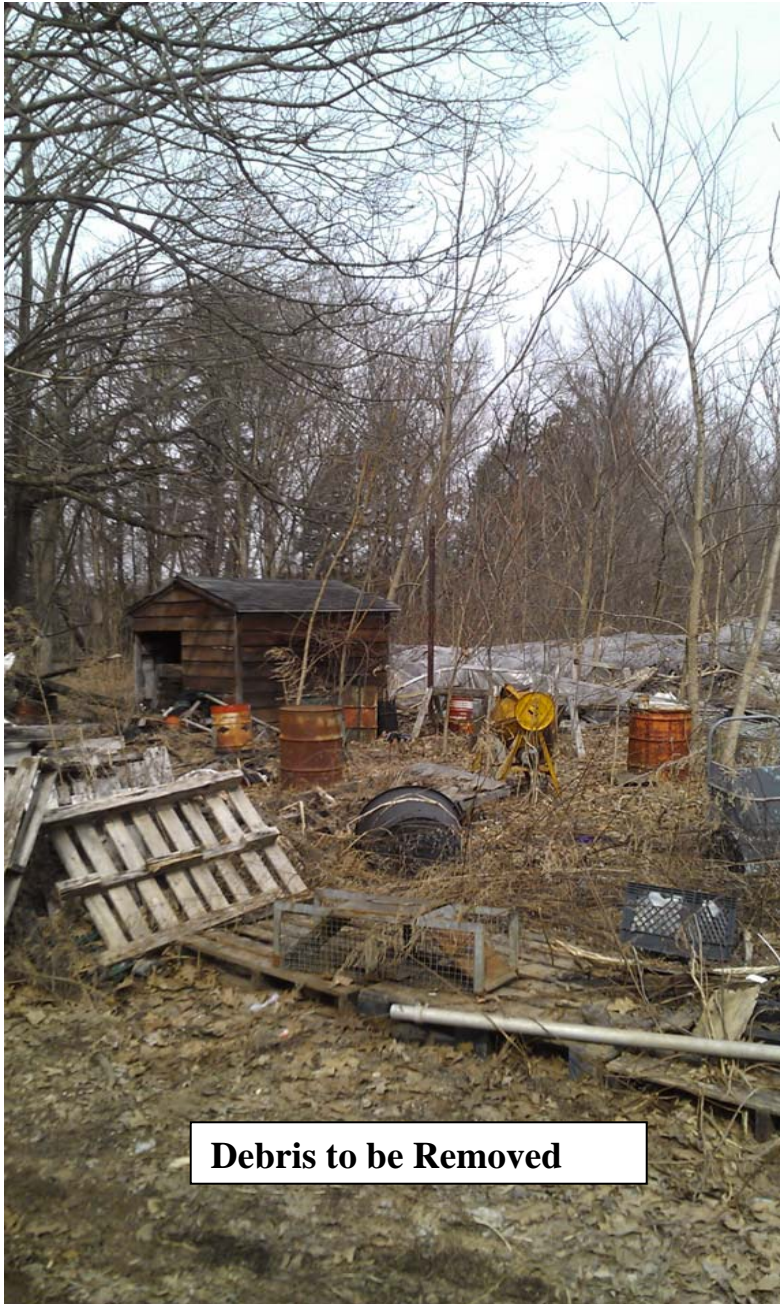
Debris to be Removed