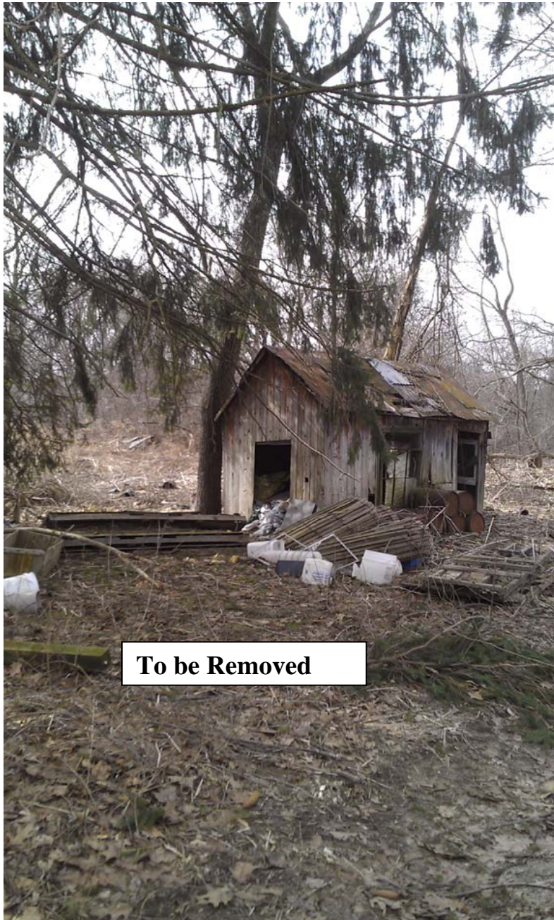
To be Removed