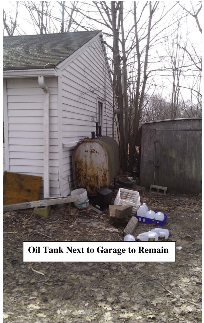
Oil Tank Next to Garage to Remain