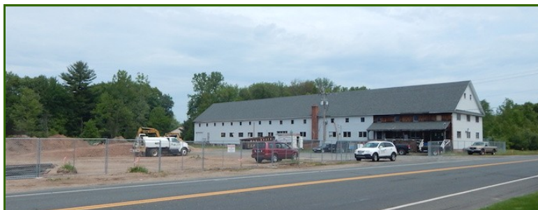
The property known as 'the pool barn' is being redeveloped.

These uses could be small or large as the barn will accommodate a variety of unit sizes depending on the tenant's need. This facility should be open for business this fall.