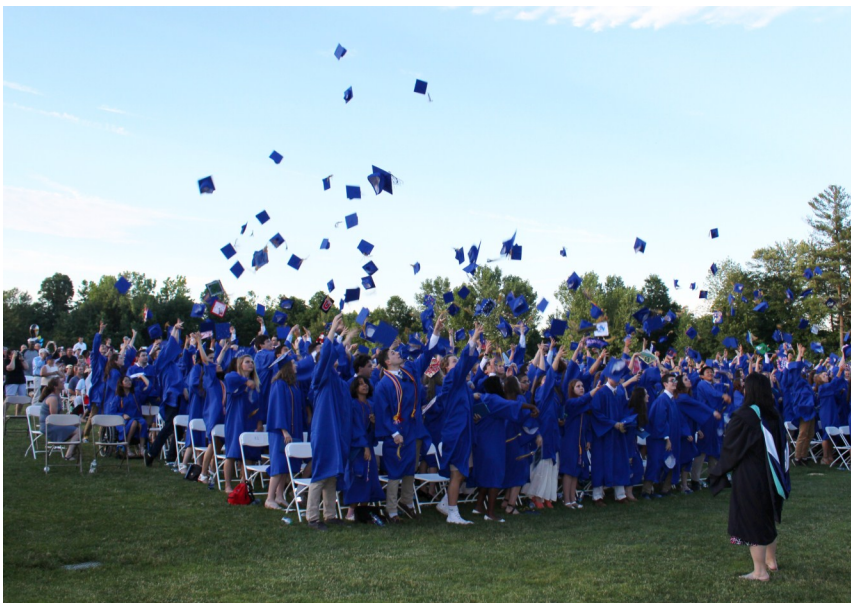
Photo of Simsbury High School graduation

The Simsbury Public Schools cultivate the mind, body, and character of each student. We engage students with a meaningful and rigorous academic foundation so that they can contribute to a global society with integrity, compassion, and resilience.