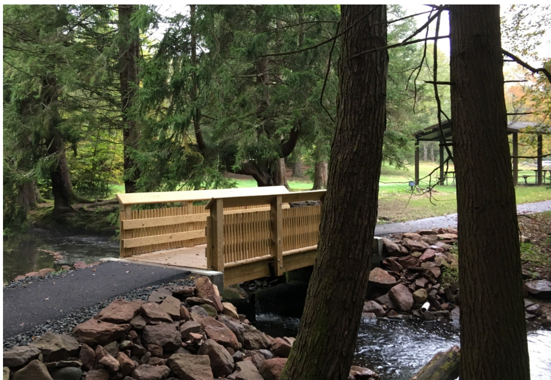
New foot- bridge over Stratton Brook to Ethel Walker Woods trails

The mission of the Engineering department is to provide professional infrastructure and building design, project management, and planning services to effectively sustain and improve the current quality of life for Simsbury residents and businesses.