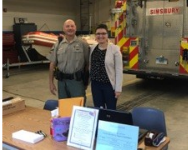
Pictured above is the Animal Control Officer and Town Clerk at the Microchip Clinic on June 23, 2018

It is the mission of the Town Clerk's Office to serve as the liaison between the local government and the residents and patrons of Simsbury, making sure that information is easily accessible and reliably provided, all while delivering the highest quality of customer service.