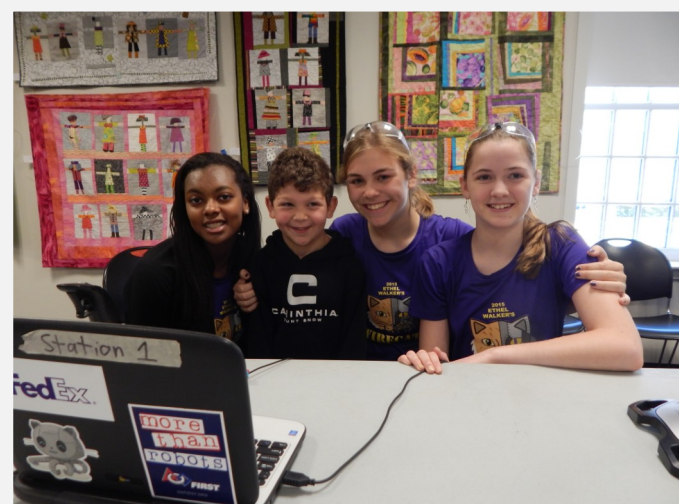
Scenes from Simsbury's Innovation Fair, April 25