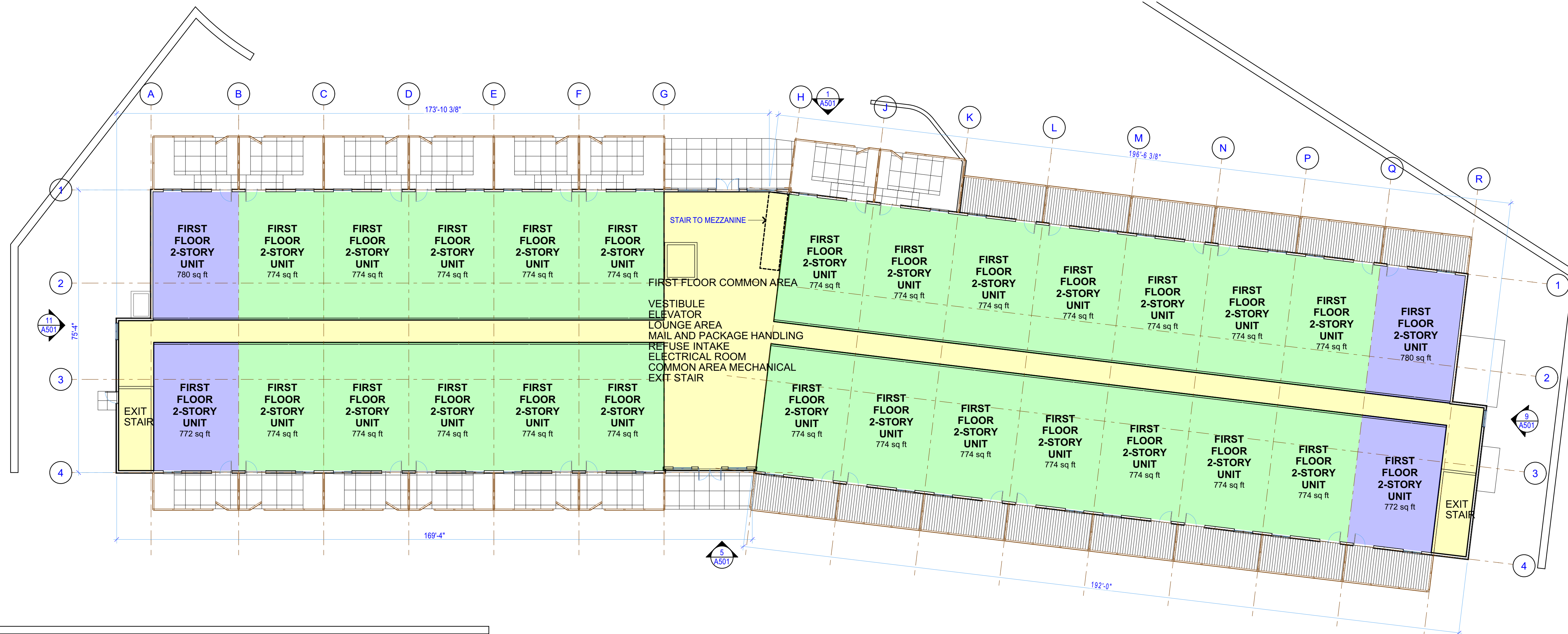
5 FLOOR PLAN - ENTRY LEVEL BUILDING G A101 SCALE: 1/16" = 1'-0"