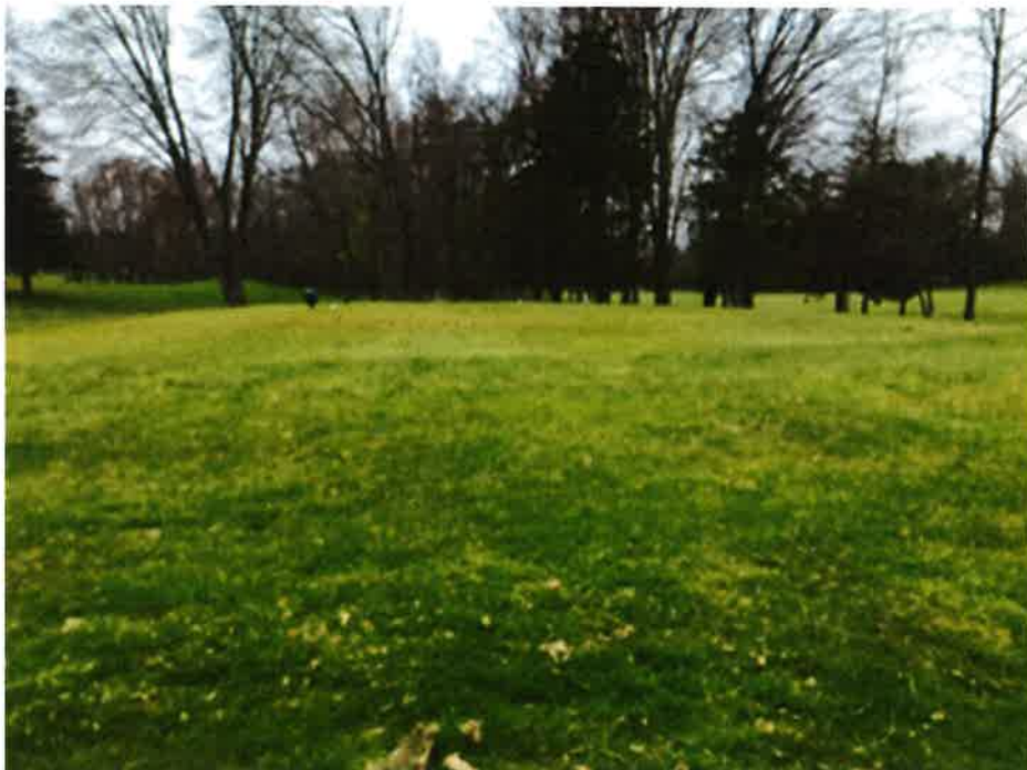
Coming Soon - Tee Leveling on Hole 4 back tee and others