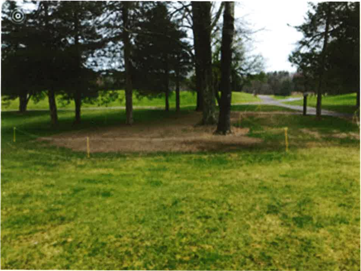
In Progress - Tree Root Covering and seeding at Simsbury Farms Golf Course