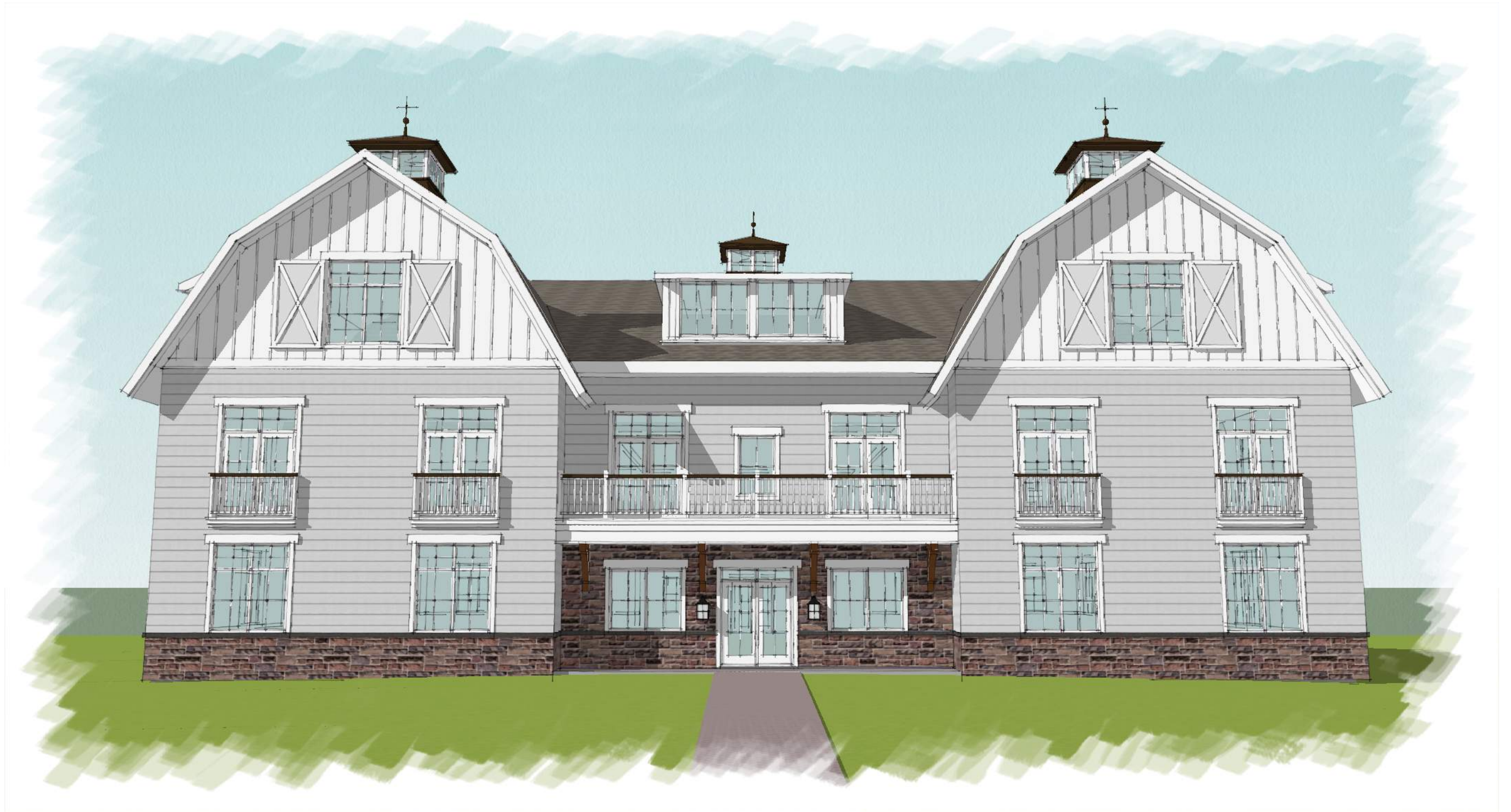
PROPOSED BARN RESIDENCES THE RIDGE AT TALCOTT MOUNTAIN -HOPMEADOW ST -SIMSBURY-CT