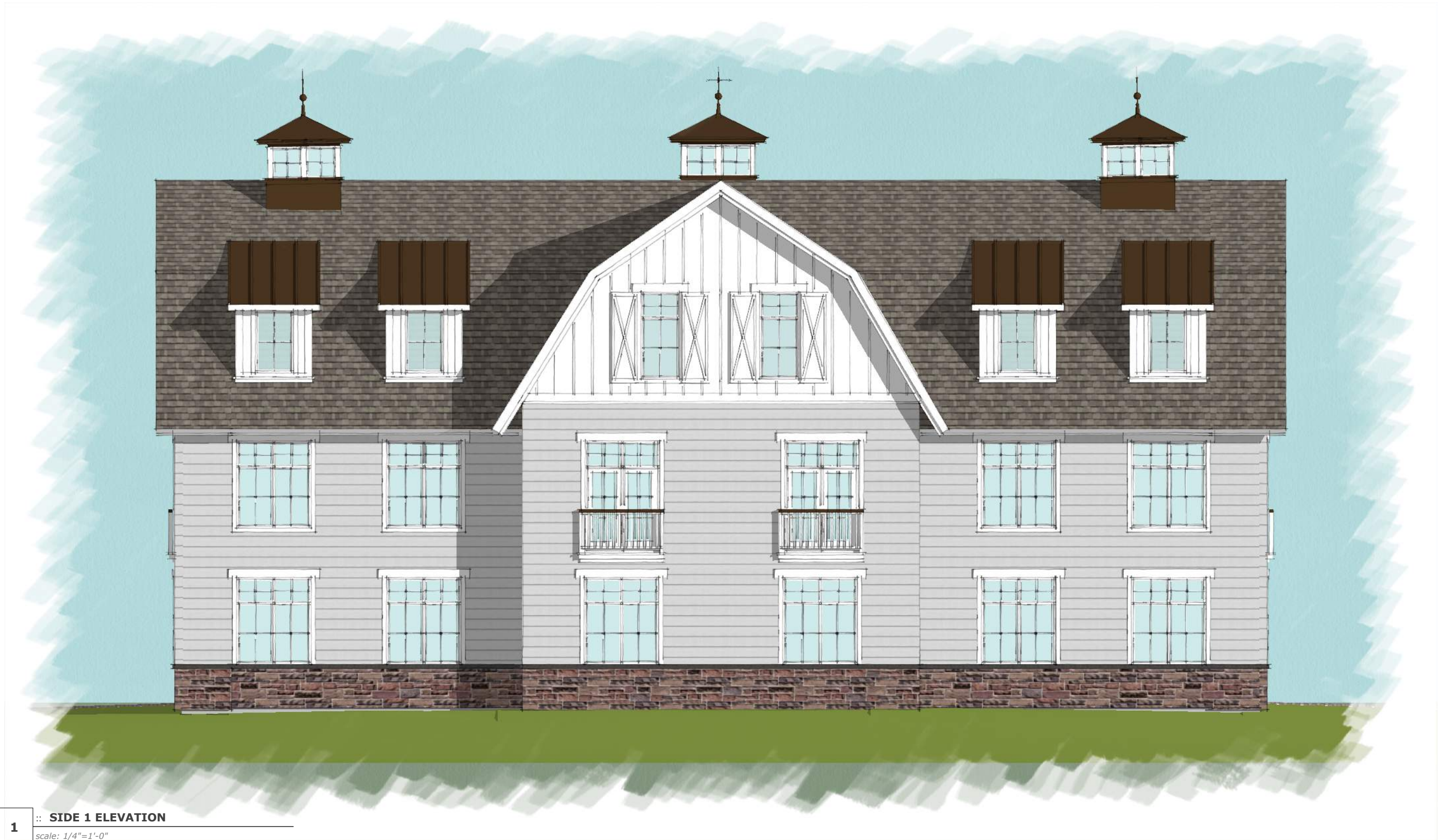
1 :: SIDE 1 ELEVATION scale: 1/4"=1'-0"