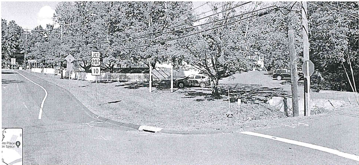
Existing Sign and Location

Lauretano Sign Group is proposing to replace the existing free-standing sign for the Bright Path Child Care located at 1 St. John's Place. The +-28 sq.ft. sign meets the size requirements for a free-standing sign. The sign will replace the existing sign in the same location (near the intersection of Tariffville Rd. and St. John's Place), previously approved as part of a site plan.