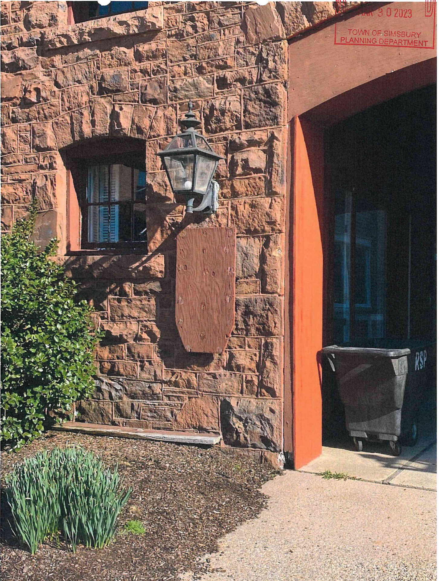
similar to old sign to left

RECEIVED MAR 30 2023 TOWN OF SIMSBURY PLANNING DEPARTMENT