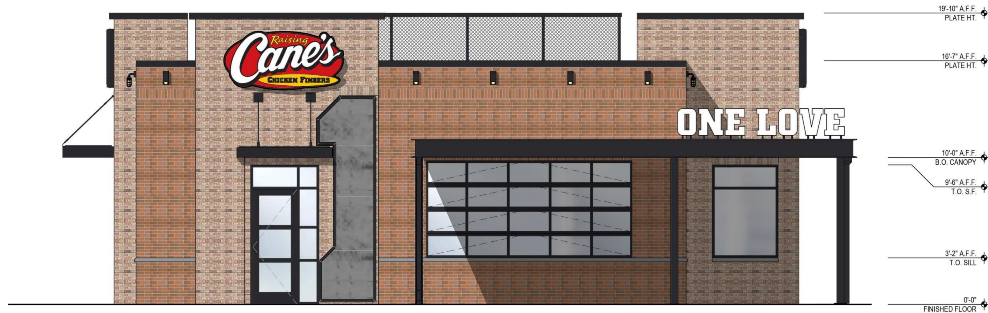
2 FRONT ENTRY ELEVATION EL 1 SCALE: 1/4" = 1'-0"