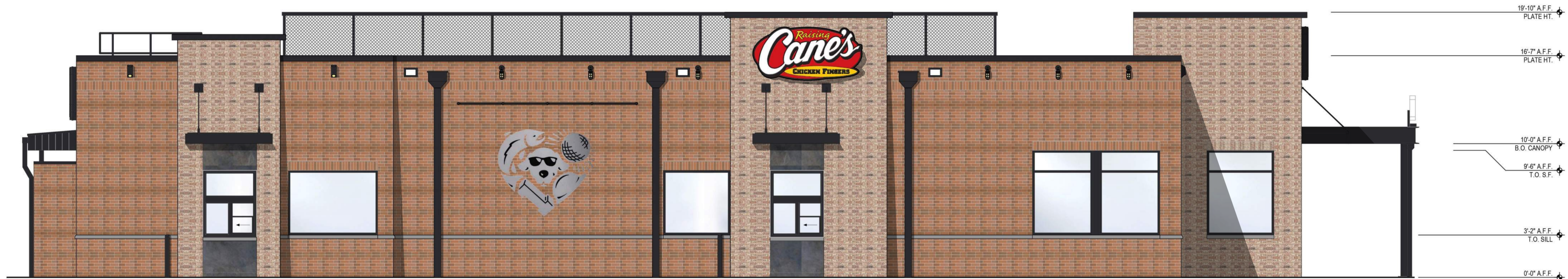
1 DRIVE-THRU ELEVATION EL 1 SCALE: 1/4" = 1'-0"