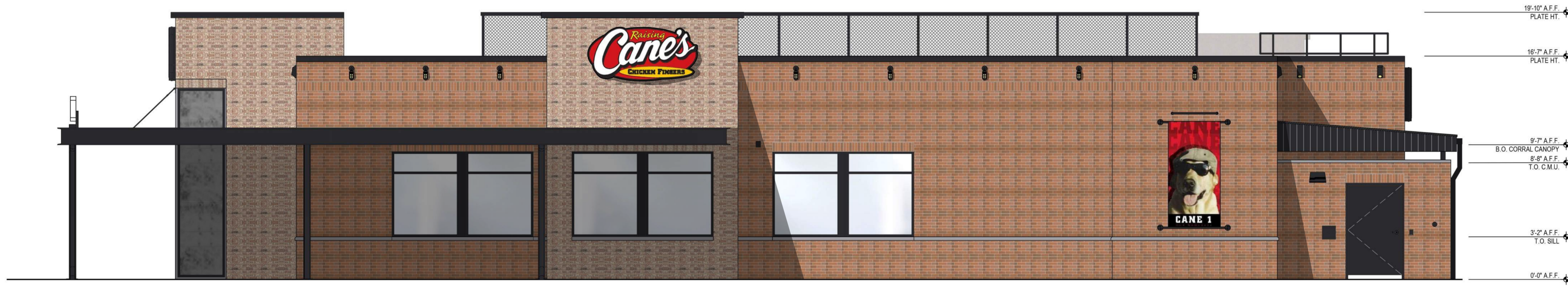
1 SIDE ENTRY ELEVATION EL 2 SCALE: 1/4" = 1'-0"