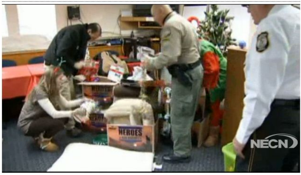
Simsbury, Conn. police collecting gifts for soldiers, canine partners